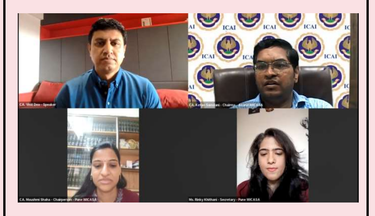
Emerging Oppurtunities for CA's on 18th April,2022