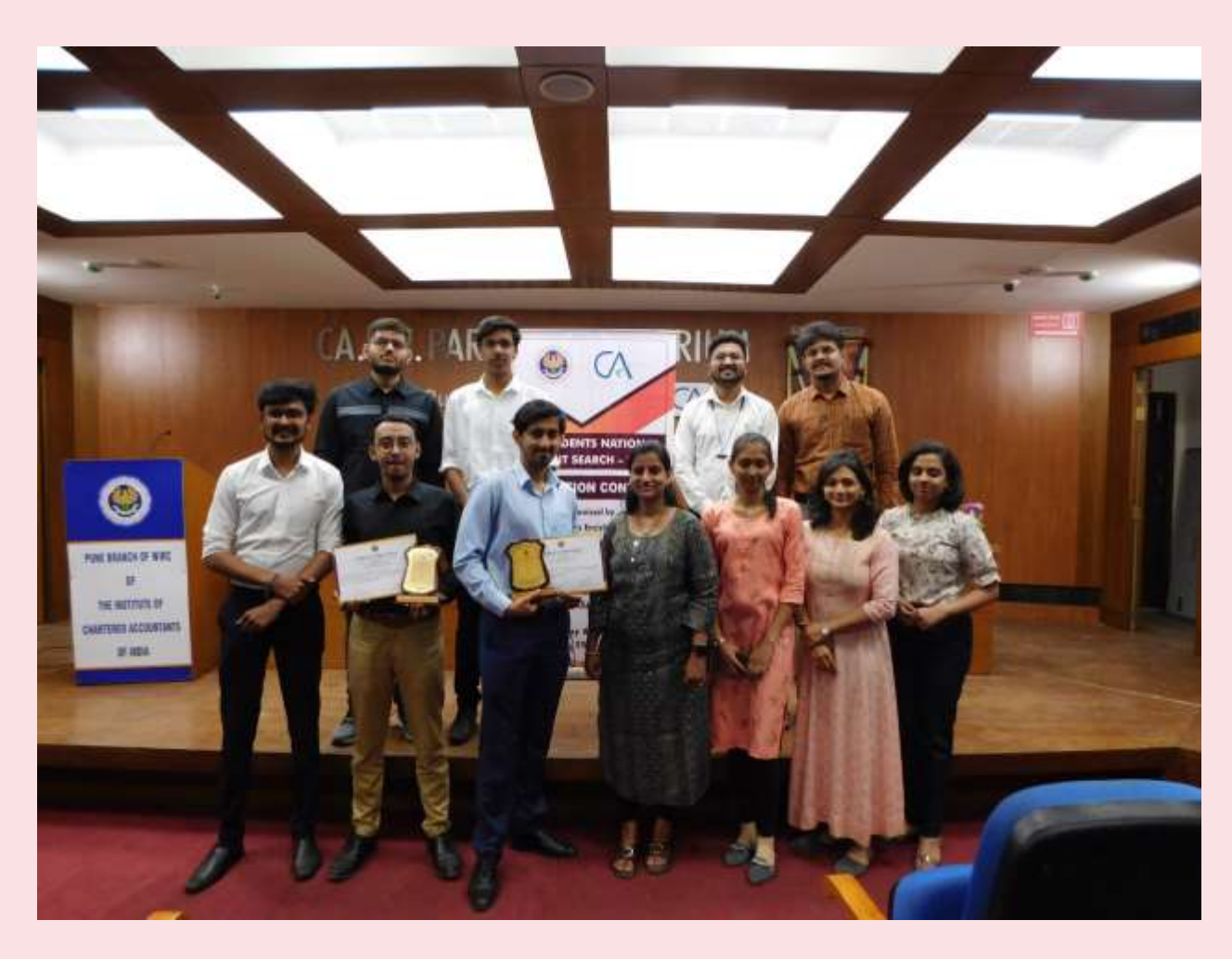
CA Students' Talent Search - Elocution Competition 2022 on 25th April, 2022